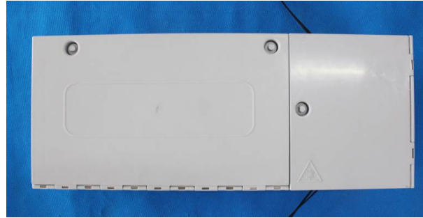
Opened MOTB-DG03 termination box